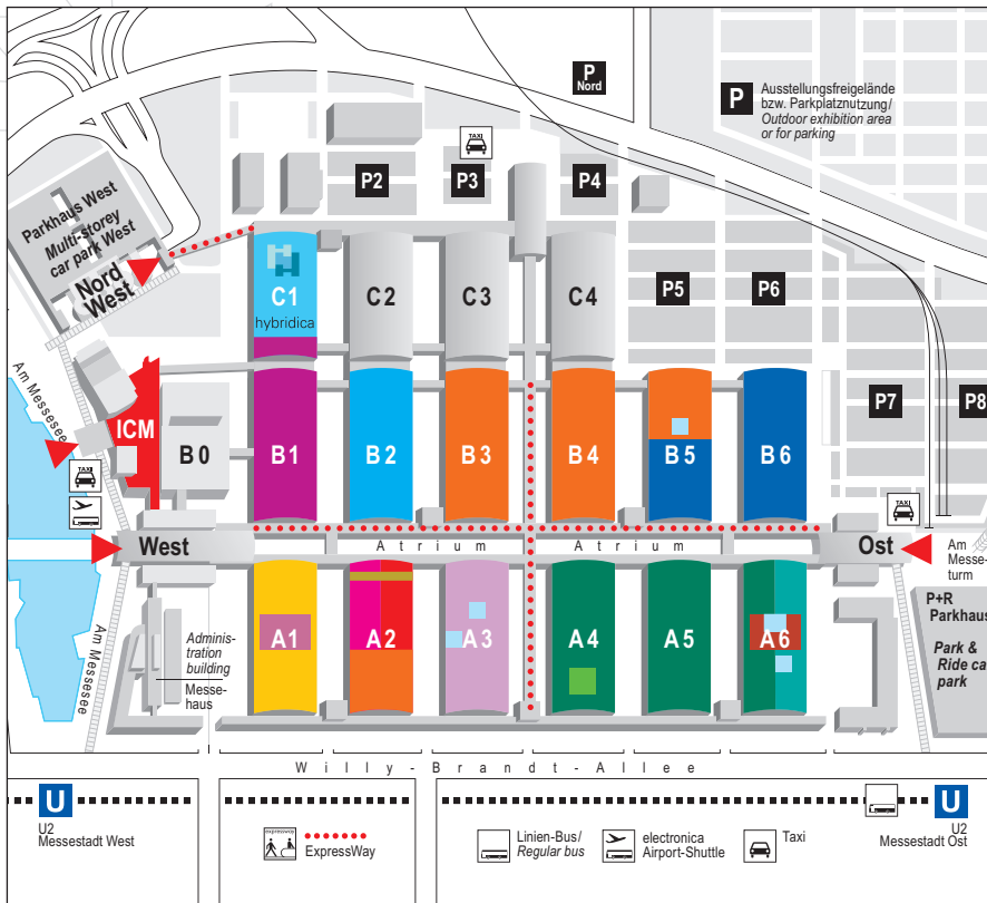
Hall diagram from 2010