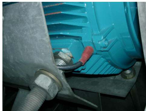
Picture 2: Industrial accelerometers attached to the bearing plate of the air propulsion motor

PRÜFTECHNIK offers contracts for online system maintenance.